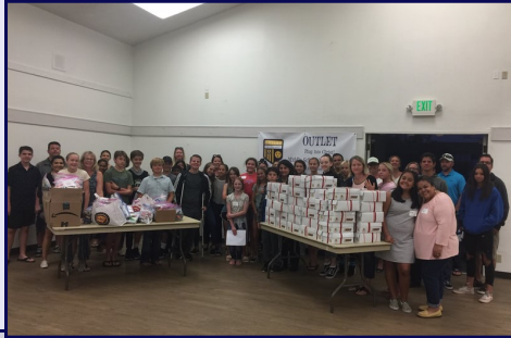
100 Boxes of Joy and hygiene bags for the homeless

OUTLET is all about service and working together... having fun at the same time!